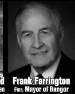
Frank Farrington Fmr. Mayor of Bangor